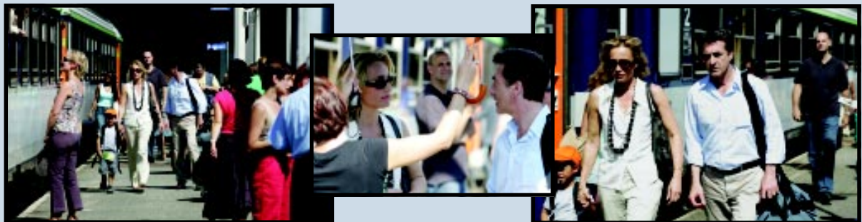
Author, Harlan Coben, Gamma '84 (center above, background right) makes an appearance in the French film adapted from his novel, "Tell No One."