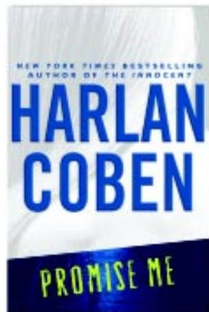
Coben's most recent best-selling thriller, Promise Me , debuted on April 25, 2006.

The director showed Coben an early cut before subtitles were added. “I could follow the story, but couldn't understand a word,” said Coben who does not speak